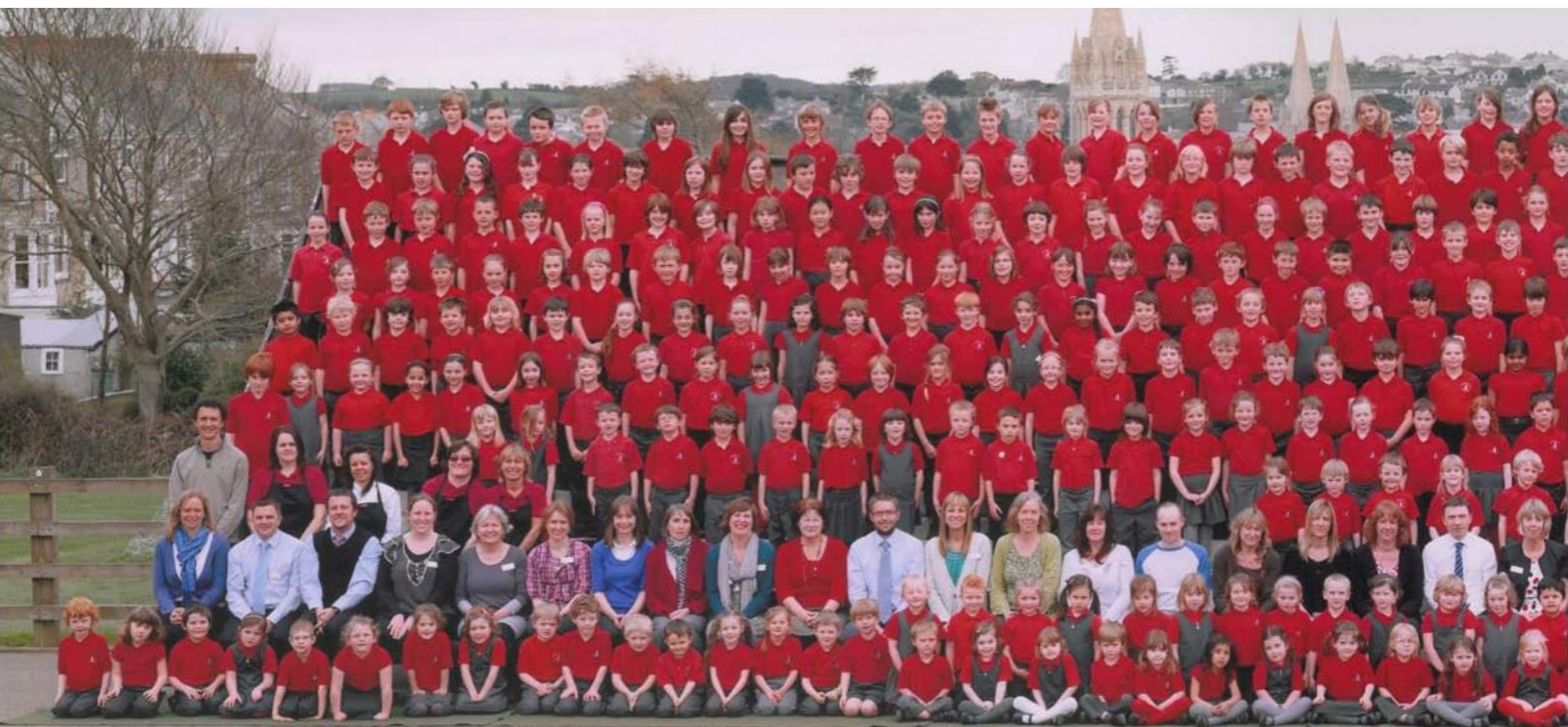
Archbishop Benson C Aca