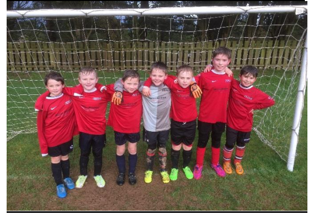
Year 4 Boys' Football Matches v Truro Prep School