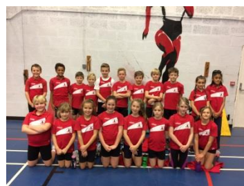
Our fantastic Year 5 and 6 team