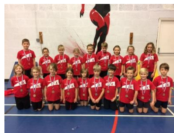
Our winning Year 3 and 4 team!